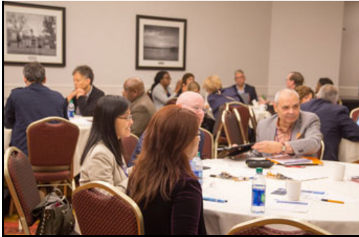
A Mentored Approach to YOUR Development