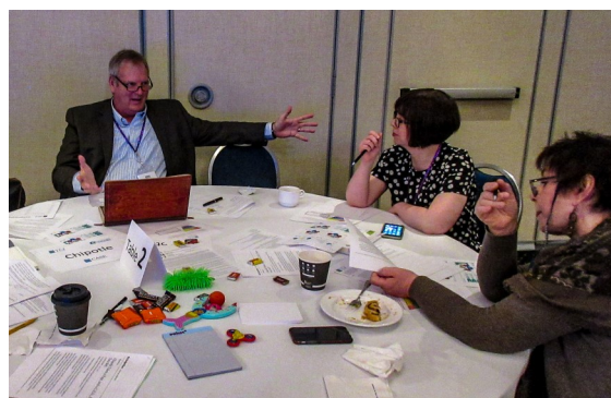
2018 CASE Hackathon discussion

Each Compact Case Hackathon will begin with a short case writing presentation focusing on the unique aspects of Compact Cases. Participants then will spend the bulk of the session “hacking” their cases, starting first with the development of learning objectives and then writing the initial draft of the case itself. The Hackathon will conclude with the presentation of cases and provision of constructive feedback for developing the cases further for journal submission. All cases developed in a Compact Case Hackathon that are subsequently accepted for publication in TCJ will be considered for recognition (and a prize!) as the “Best Compact Case.”